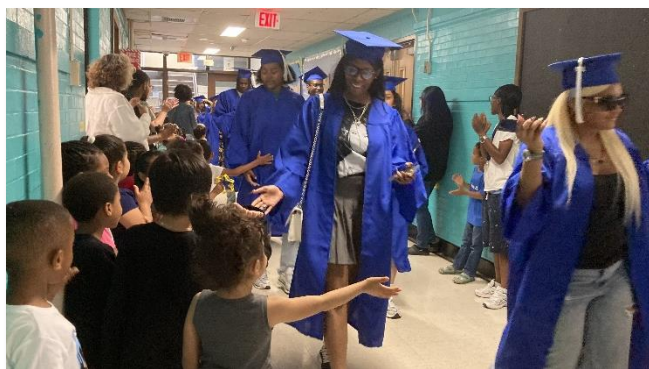
Students greeted the seniors as they walked the halls of the Smith School Early Learning Center. Later they took a group photo at City Hall. Find video of the day on the district's YouTube page .

memory lane. One senior left Morse in tears after a teacher gifted him a lunchbox with a unicorn on it; when he was her student, he had repeatedly told her he wanted to be a unicorn.