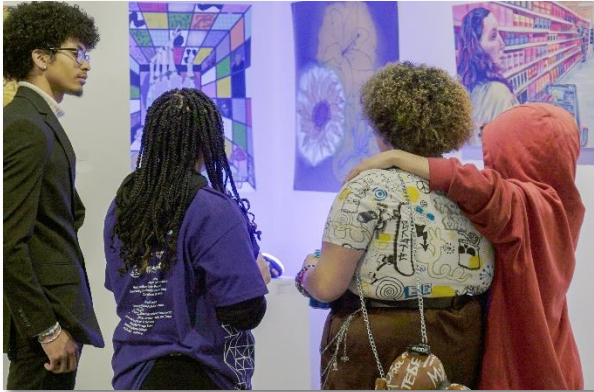
Attendees look at student art during last year's PKX Festival.

The creativity and talent of the City of Poughkeepsie's youth will be on display Saturday at a free festival.