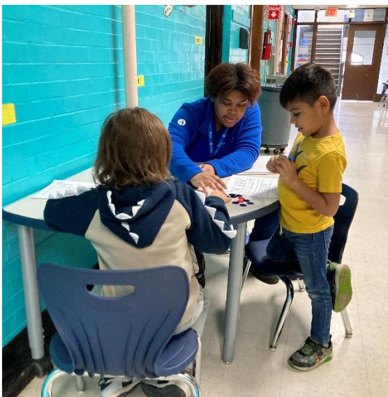
Two ELC students receive guidance from an Ampact tutor earlier this year.

The list doesn't end there. Visit this link to read about the district's milestone accomplishments since 2020.