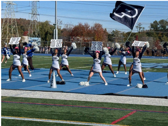
Varsity Cheerleading Team

Pioneer JV and Varsity cheer had an amazing season. After attending UCA cheer camp this summer in Pennsylvania, both teams hit the mat and showcased the game-day routine learned at camp. The team competed in four competitions, including their own competition at PHS.