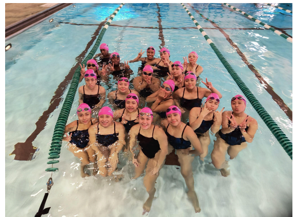
Varsity Girls Swim Team

PK girls celebrating Breast Cancer Awareness all October wearing pink caps to support at Conference Champs and October dual meets.