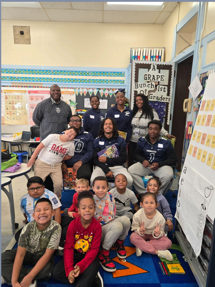
Reading walks from PHS Varsity Football Players and Cheerleaders

As the fall is now complete and a thing of the past, our fall teams competed hard and gracefully throughout the season. Each day our athletes learned either how to better themselves or what they can do to better others. Now that the chapter has turned to the winter and indoor activities, the athletic department is excited to embrace this upcoming season. Come out and support our Pioneer athletics whether it be at the pool, in the gym or at the bowling alley. GO PIONEERS!