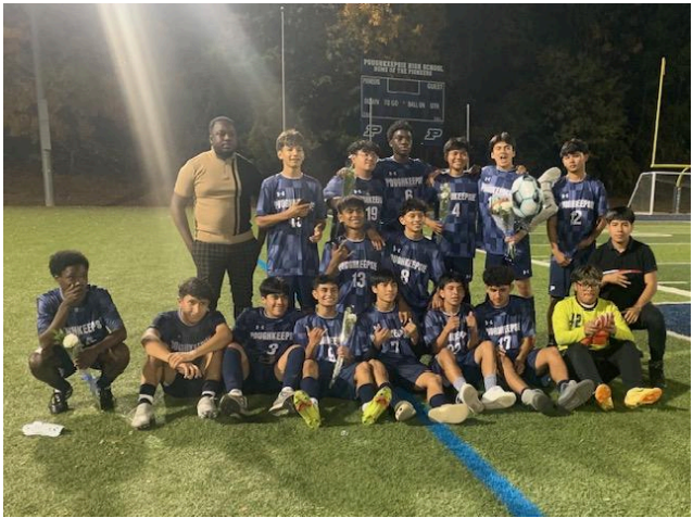
Varsity Boys Soccer Team